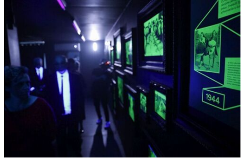
A new exhibition and interactive educational project prepared by the Institute of National Remembrance