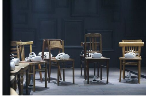
A new exhibition and interactive educational project prepared by the Institute of National Remembrance