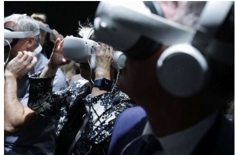
A new exhibition and interactive educational project prepared by the Institute of National Remembrance