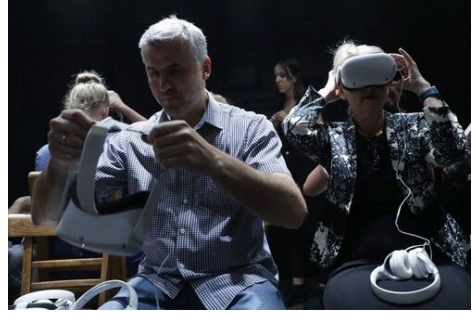
A new exhibition and interactive educational project prepared by the Institute of National Remembrance