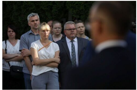
A new exhibition and interactive educational project prepared by the Institute of National Remembrance