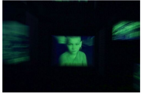
A new exhibition and interactive educational project prepared by the Institute of National Remembrance