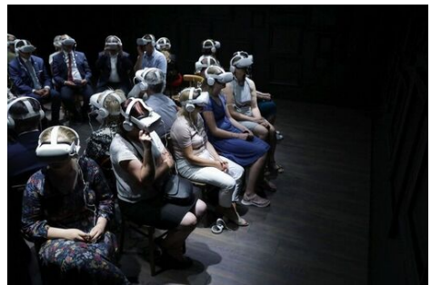
A new exhibition and interactive educational project prepared by the Institute of National Remembrance