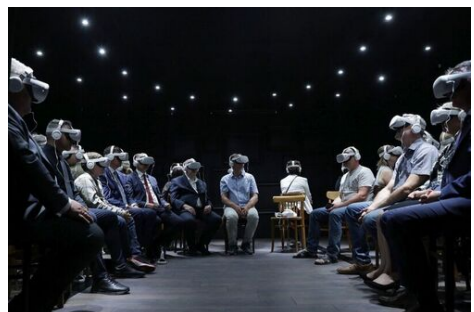
A new exhibition and interactive educational project prepared by the Institute of National Remembrance