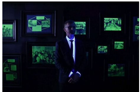
A new exhibition and interactive educational project prepared by the Institute of National Remembrance