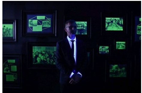
A new exhibition and interactive educational project prepared by the Institute of National Remembrance