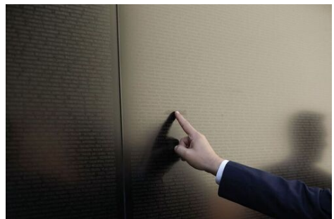
A new exhibition and interactive educational project prepared by the Institute of National Remembrance, photo: Mikołaj Bujak, IPN