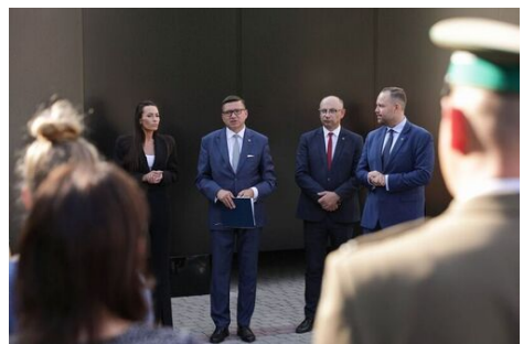
A new exhibition and interactive educational project prepared by the Institute of National Remembrance, photo: Mikołaj Bujak, IPN